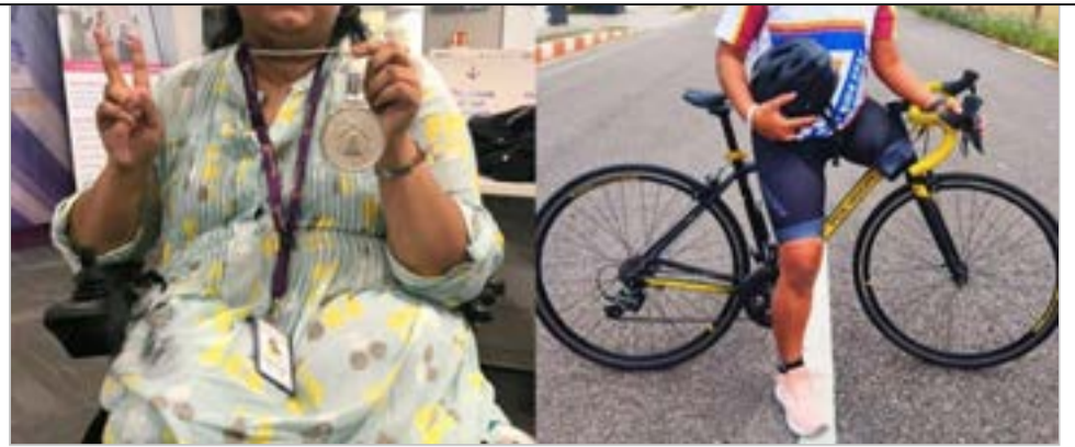
Defying all odds to succeed.