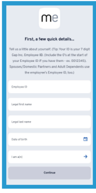
STEP 2: VERIFICATION

Enter your 7 digit Employee ID Note: Both employee and spouse will use the employee ID to register