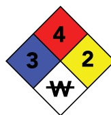
Example NFPA label

Container labels use words, symbols, numbers, and colors to quickly communicate information about a chemical's potential hazards (e.g., flammability, reactivity, physical hazard), and precautions to take when handling them. All chemical containers must be labeled to provide this information. The two most common types of container labels are the National Fire Protection Association, or "NFPA" label, and the Hazardous Materials Identification System, or "HMIS" label. The customer will provide site-specific information concerning how to interpret the labeling system they utilize.