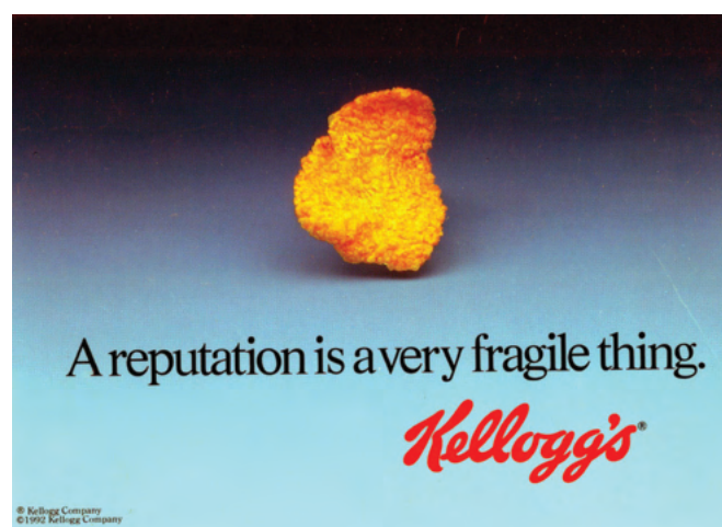
Legacy of Quality and Integrity – Photo from 1981 advertisement