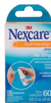
Liquid Bandage Item No. 1872