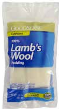
Lamb's Wool Padding Item No. 1786