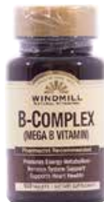
Vitamin B-Complex, Natural † Item No. 2079 $10 00 - 100 ct