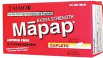
Acetaminophen (Pain Reliever, Extra Strength) Item No. 2030