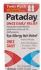
Pataday® Daily Release (Olopatidine) Twin Pack Item No. 1801