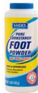
Foot Powder, Medicated Item No. 1240