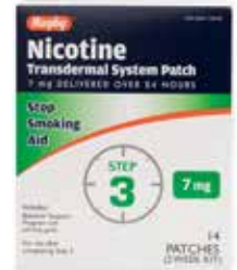
Nicotine Patch, Step 3 † Item No. 1371