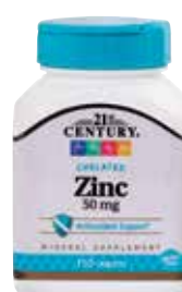
Zinc, Chelated ‡ Item No. 1419