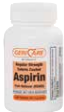
Aspirin, Enteric Coated Item No. 1096