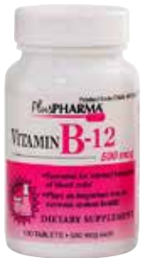
Vitamin B-12 † Item No. 1389 $6 00 - 100 ct/500 mcg