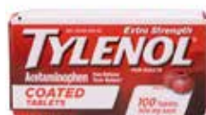
Tylenol® Extra Strength Item No. 2058