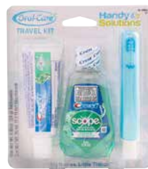
Dental Travel Kit Item No. 1749