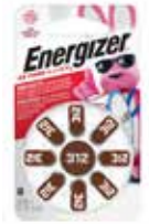
Hearing Aid Batteries