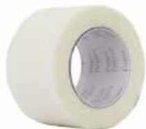
Tape, Paper Surgical - 1" x 10 yd Item No. 1217