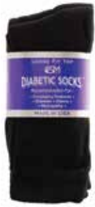
Diabetic Socks, Black • Medium Item No. 1956 • Large Item No. 1957 • X-Large Item No. 1958