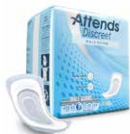
Attends® Discreet Men's Guard Item No. 1811