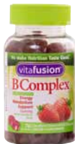
Vitamin B-Complex, Gummy † Item No. 1915 $12 00 - Compare to Vitafusion® - 70 ct