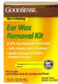
Ear Wax Removal System with Rubber Bulb Item No. 1363