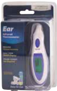
Thermometer, Digital Ear Item No. 1285 $30 00 - 1 ct