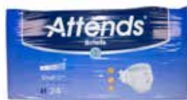
Adult Briefs Small - 25" to 34" Item No. 1510