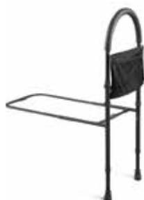
Bed Assist Bar Item No. 2009