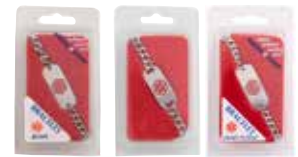
Medical ID Bracelet: