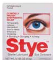
Eye Ointment, Stye® Item No. 1906

- Compare to Visine® Original Redness Relief - 15 ml/0.05%