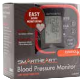
Blood Pressure Monitor, Desktop Automatic ‡ Item No. 1253