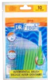
Interdental Gum Brushes Item No. 1748