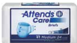
Adult Briefs Medium - 32" to 44" Item No. 2026