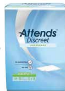
Underpad, Disposable - 23" x 36" Item No. 2029