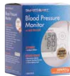
Blood Pressure Monitor, Wrist ‡ Item No. 1501