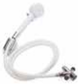
Shower Head, Handheld Item No. 2007