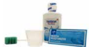
Oral Care System Kit Item No. 1750