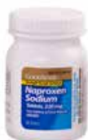
Naproxen Sodium (Pain Reliever/Fever Reducer) Item No. 2032