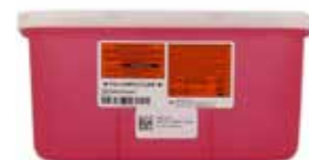
Sharps Container, 1 gallon