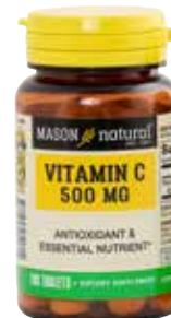
Vitamin C † Item No. 1017 $6 00 - 100 ct/500 mg