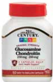
Glucosamine/Chondroitin (Joint Health Support) † Item No. 1003