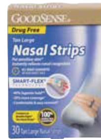
Nasal Strips, Large Item No. 1725