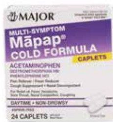
Multi-Symptom Cold Formula Item No. 1357