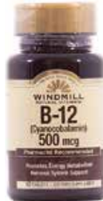
Vitamin B-12, Natural † Item No. 2082 $10 00 - 60 ct/500 mcg