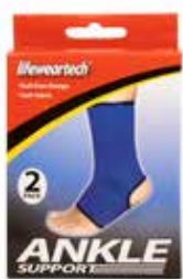
Ankle Support Item No. 1225 $8 00