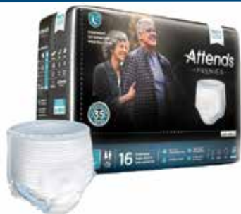
Premier® Disposable Underwear, Large - 44" to 58" Item No. 1991