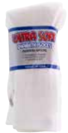
Diabetic Socks, White, Ultra Soft Padded • Medium Item No. 1962 • Large Item No. 1963 • X-Large Item No. 1964