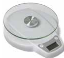
Scale, Kitchen, Digital ‡ Item No. 2016