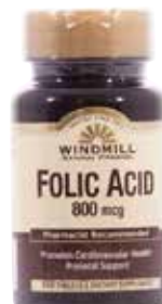
Folic Acid, Natural † Item No. 2093