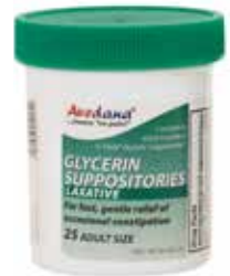
Laxative, Glycerin Suppository Item No. 1125