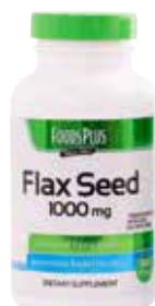
Flaxseed † Item No. 1849