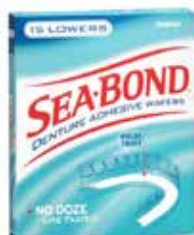
Denture Adhesive Wafers, Lowers, Sea-Bond® Item No. 2038