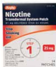
Nicotine Patch, Step 1 † Item No. 1369