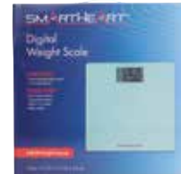
Bathroom Scale ‡ Item No. 1935