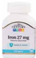
Ferrous Gluconate (Iron Supplement) † Item No. 1417