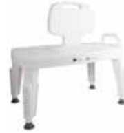
Transfer Bench, Adjustable Item No. 1764