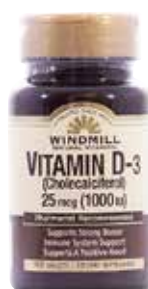
Vitamin D3, Natural ‡ Item No. 2077