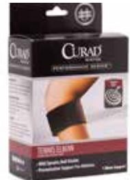
Elbow Support, Tennis