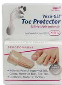
Toe Protector, Small Item No. 1788