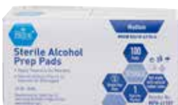
Alcohol Pads Item No. 1200