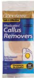
Callus Remover Pads Item No. 1238