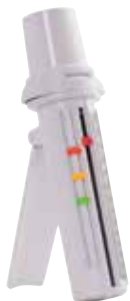
Peak Flow Meter † Item No. 1789 $17 00 - 1 ct