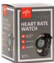
Heart Rate Monitor Watch † Item No. 1771 $40 00 - 1 ct