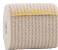
Bandage, Elastic - 2" x 4.5 yd Item No. 1207