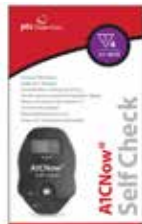
A1C Self Check Now Item No. 2201