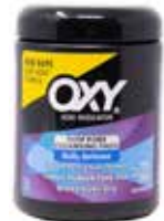
Oxy® Daily Cleansing Pads Maximum Item No. 2056