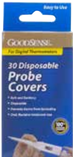
Thermometer Probe Covers Item No. 1752 $3 50 - 30 ct