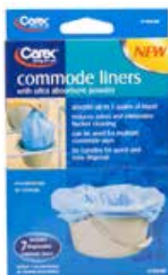
Commode Liner Item No. 2045