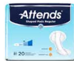
Bladder Control Shaped Pad, Moderate Absorbency Item No. 1478