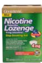
Nicotine Lozenges † Item No. 1281