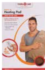
Heating Pad, X-Large, 12" x 24" Item No. 1942