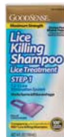
Lice Treatment Shampoo Item No. 1271