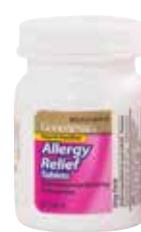
Diphenhydramine Antihistamine (Allergy Tablets) Item No. 1308