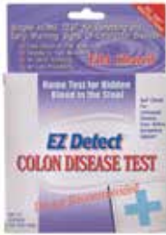
EZ Detect® Colon Cancer Test Kit † Item No. 1416 $13 00 - 1 ct