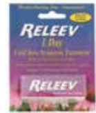
Releev® Cold Sore Treatment Item No. 1359