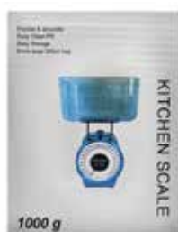
Scale, Kitchen, Dial ‡ Item No. 1756