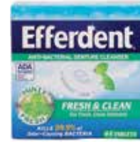
Efferdent® Plus Mint Tablets Item No. 1653