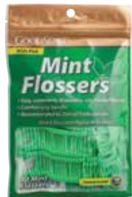
Interdental Flossups Item No. 1751