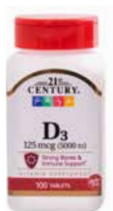
Vitamin D3 ‡ Item No. 1973

Please note that the products you receive may look different from the images shown in this brochure. The packaging could change throughout the year. Be assured, the active ingredients in the products will remain the same.