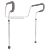
Toilet Safety Rails Item No. 1779