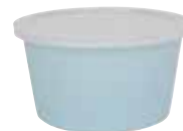
Denture Case Item No. 1515