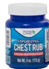
Vapor Rub Item No. 1164