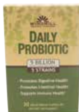
Digestive Advantage – Probiotic Item No. 1204