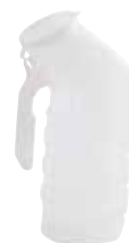
Urinal, Male Item No. 2049