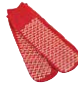
Slipper Socks, Treaded, One Size Fits Most Item No. 2008