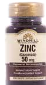
Zinc, Natural ‡ Item No. 2090