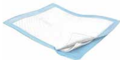
Underpad, Disposable - 30" x 30" Item No. 1477