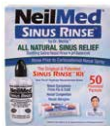
Nasal Rinse Kit, Saline Item No. 1931