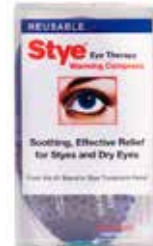
Eye Compress, Stye® Item No. 1905

- Compare to Renu® Multipurpose Solution - 12 oz