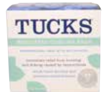
Tucks® Medicated Cooling Pads by Blistex®