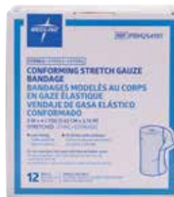
Bandages, Gauze Sterile, Conforming Stretch - 3" x 4.1 yd Item No. 1223