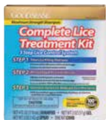
Lice Elimination Kit Item No. 1929