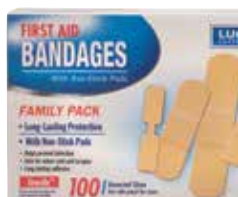
Adhesive Bandages Item No. 1344