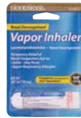
Nasal Decongestant Inhaler - Levmetamfetamine Item No. 1922