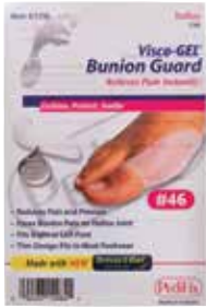
Bunion Guard Item No. 1784