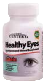
Healthy Eyes® with Lutein † Item No. 1975