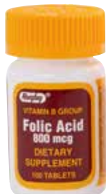
Folic Acid † Item No. 1850