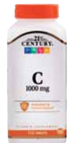
Vitamin C † Item No. 1706 $11 00 - 110 ct/1,000 mg