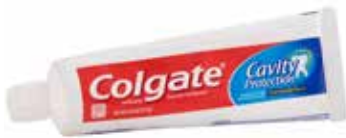
Toothpaste, Colgate® Item No. 1831