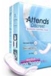
Attends® Discreet Women's Maximum Bladder Control Pad Item No. 1812