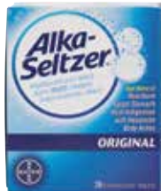
Alka-Seltzer® Item No. 1313