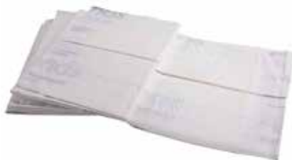
Underpad, Extra Absorbent, Air Permeable, 30" x 36" Item No. 1996