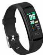
Activity Tracker Item No. 1982