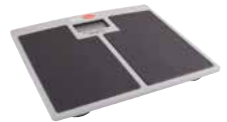
Bathroom Scale, Talking ‡ Item No. 1981