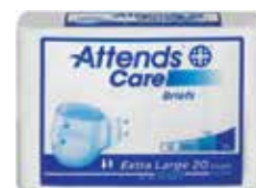
Adult Briefs X-Large - 58" to 63" Item No. 2028