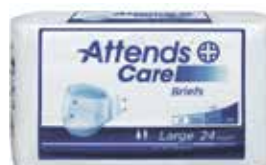
Adult Briefs Large - 44" to 58" Item No. 2027