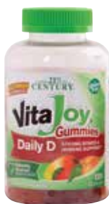
Vitamin D3, Gummy ‡ Item No. 1978