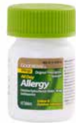
Cetirizine HCL (Allergy Tablets) Item No. 2003