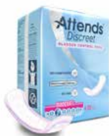
Attends® Discreet Women's Moderate Bladder Control Pad Item No. 1813