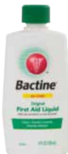
Bactine® Solution Item No. 1142