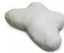
Pillow, CPAP, Fiber Filled Item No. 1836