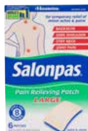
Salonpas® Pain Relief Patches Item No. 1739