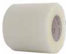
Tape, Transparent Surgical - 2" x 10 yd Item No. 1222