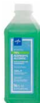
Isopropyl Alcohol, Wintergreen Item No. 1229