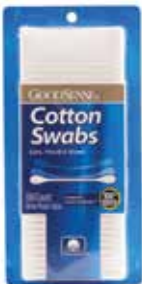
Cotton Tipped Swabs Item No. 1742 $6 00 - Compare to Johnson & Johnson® - 300 ct