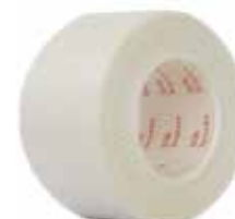
Tape, Silk Surgical - 1" x 10 yd Item No. 1219