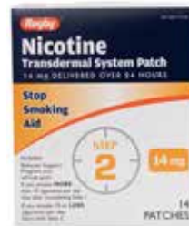
Nicotine Patch, Step 2 † Item No. 1370