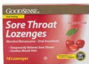
Sore Throat Lozenges, Cherry Item No. 1176