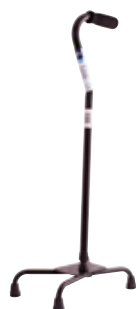
Cane, Quad, Large Base Item No. 1776