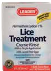
Lice Treatment Rinse (Permethrin) Item No. 1269