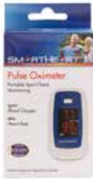
Finger Pulse Oximeter † Item No. 1505 $30 00 - 1 ct