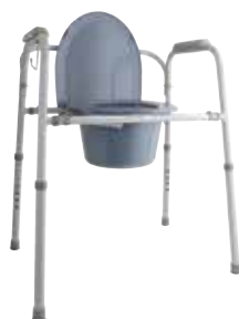
Bedside Commode Item No. 1984