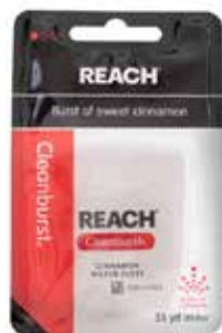
Dental Floss, Reach® Waxed - Cinnamon Item No. 1901