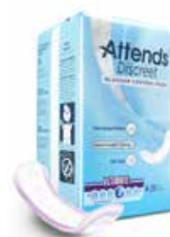
Attends® Discreet Women's Ultimate Bladder Control Pad Item No. 1814