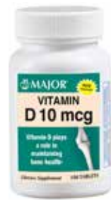
Vitamin D3 † Item No. 1383 $6 00 - 100 ct/10 mcg