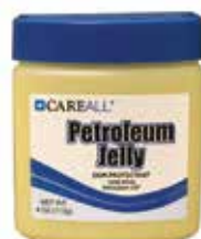
Petroleum Jelly Item No. 2018