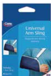
Arm Sling Item No. 2041 $13 50