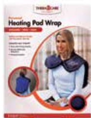
Heating Pad Wrap For Shoulder, Neck, and Back, 25" x 26" Item No. 1943