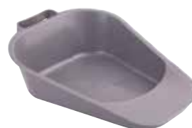
Bedpan Item No. 2048