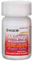
Acetaminophen (Children's Pain Relief Chewables) Item No. 1423