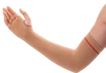
Arm Sleeve, Protective - Small Item 1897 $20 00