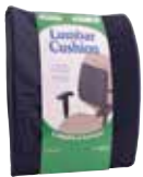
Cushion, Lumbar Item No. 1731