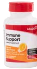
Immune Support Chewables † Item No. 1866