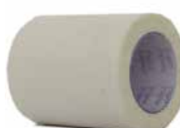
Tape, Paper Surgical - 2" x 10 yd Item No. 1218