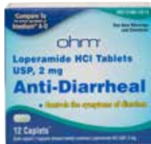
Loperamide HCL (Anti- Diarrheal Tablets) Item No. 1133