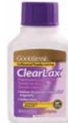
Laxative, ClearLax® Unflavored Powder Item No. 1969