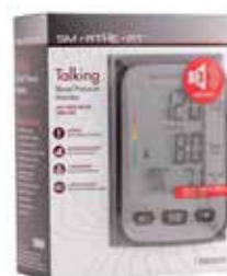
Blood Pressure Monitor, Desktop Talking ‡ Item No. 1503