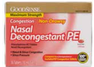
Phenylephrine HCL (Nasal Decongestant PE) Item No. 1352