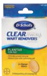
Wart Removal System, Dr. Scholl's® Item No. 1288