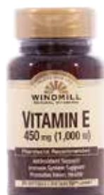
Vitamin E, Soft Gels, Natural ‡ Item No. 2087