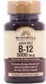
Vitamin B-12, Sublingual, Natural † Item No. 2083 $18 00 - 60 ct/5,000 mcg