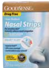
Nasal Strips, Medium Item No. 1724