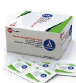
Alcohol Pads Item No. 2004