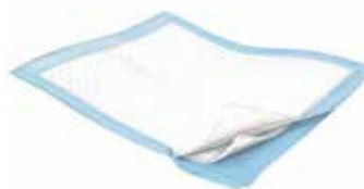
Underpad, Disposable - 23" x 24" Item No. 1476