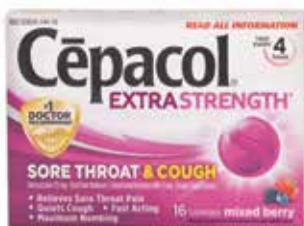
Sore Throat Lozenges, Cepacol® Item No. 1360