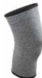
Arthritis Knee Sleeve • Small Item No. 2011 • Medium Item No. 2012 • Large Item No. 2013 • X-Large Item No. 2014 $25 00