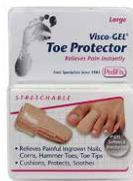
Toe Protector, Large Item No. 1787