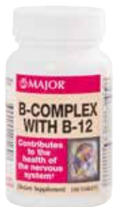
Vitamin B-Complex † Item No. 1382 $6 00 - 100 ct