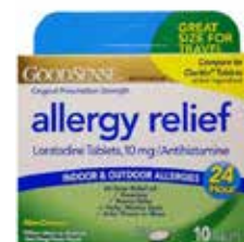
Loratadine (Allergy Tablets) Item No. 2033

- Compare to Flonase® - 120 sprays/50 mcg