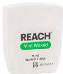
Dental Floss, Reach® Waxed - Mint Item No. 1455