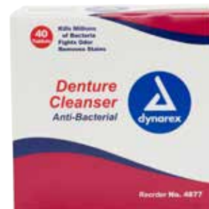
Denture Cleaning Tablets Item No. 1032