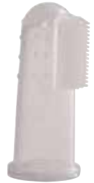
Fingertip Tooth & Gum Massager Item No. 1745