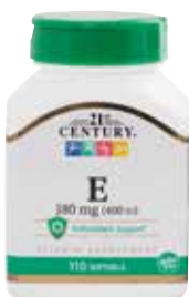
Vitamin E, Soft Gels ‡ Item No. 1384