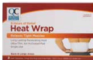
Heat Wrap - Back & Hip Item No. 1859