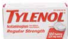
Tylenol® Regular Strength Item No. 2051