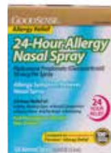
Fluticasone Propionate (Allergy Nasal Spray, 24-hour) Item No. 1946