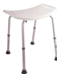
Bath Bench without Back