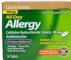
Cetirizine HCL (Allergy Tablets) Item No. 1090