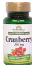
Herbal Cranberry Supplement Item No. 1206