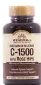
Vitamin C, with Rose Hips, Natural † Item No. 2085 $15 00 - 60 ct/1,500 mg