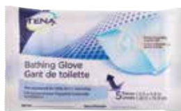
Bathing Wipes Item No. 2010

- Compare to Lantiseptic® Barrier Cream - 4 oz