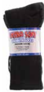
Diabetic Socks, Black, Ultra Soft Padded • Medium Item No. 1959 • Large Item No. 1960 • X-Large Item No. 1961