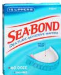
Denture Adhesive Wafers, Uppers, Sea-Bond® Item No. 2039