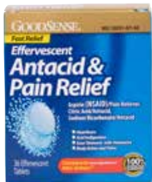
Effervescent Antacid & Pain Relief Item No. 1314