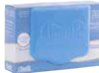
CPAP Mask Wipes Item No. 2037