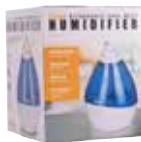
Humidifier, Ultra-Sonic Cool Mist Item No. 1795