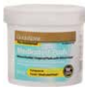
Pre-moist Hemorrhoid Pads Item No. 1364