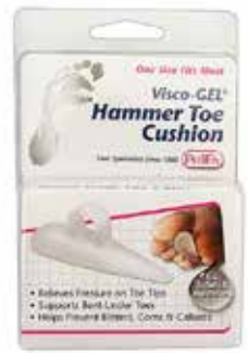
Hammer Toe Crest Item No. 1785