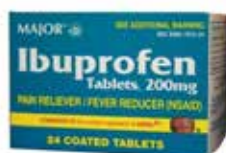
Ibuprofen (Pain Reliever/Fever Reducer) Item No. 2031