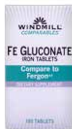
Ferrous Gluconate (Iron Supplement), Natural † Item No. 2073