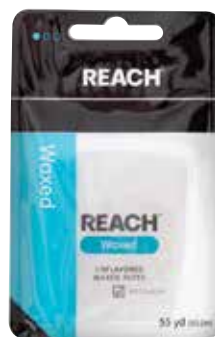
Dental Floss, Reach® Waxed - Unflavored Item No. 1902