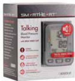
Blood Pressure Monitor, Wrist Talking † Item No. 1502 $40 00 - 1 ct

Please note that the products you receive may look different from the images shown in this brochure. The packaging could change throughout the year. Be assured, the active ingredients in the products will remain the same.