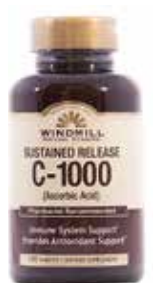
Vitamin C, Natural † Item No. 2084 $14 00 - 100 ct/1,000 mg