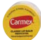
Carmex® Item No. 1255