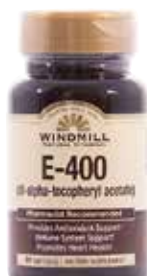
Vitamin E, Soft Gels, Natural ‡ Item No. 2086