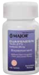
Guaifenesin (Cough Expectorant) Item No. 1180