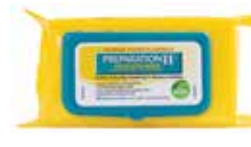
Preparation H® Medicated Wipes Item No. 1895