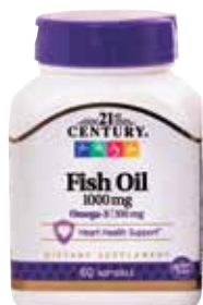
Fish Oil, Soft Gels † Item No. 1741