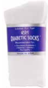
Diabetic Socks, White • Medium Item No. 1953 • Large Item No. 1954 • X-Large Item No. 1955