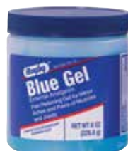
Menthol Gel Item No. 1923

- Compare to Aspercreme® Lidocaine Patch - 5 ct/4%