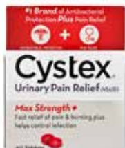
Urinary Pain Relief Tablets Item No. 2036