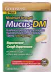
Mucus Relief DM Expectorant & Cough Suppressant, Extended Release Item No. 1965