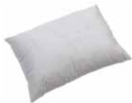
Pillow, Hypoallergenic Item No. 1936