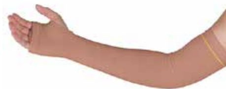
Arm Sleeve, Protective - Large Item No. 1898 $24 25