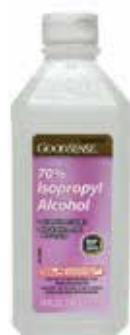
Isopropyl Alcohol Item No. 1713