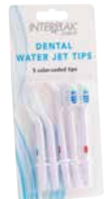
Water Jet Replacement Tips Item No. 1743