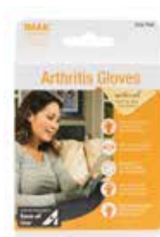
Arthritis Gloves • Small Item No. 1767 • Medium Item No. 1766 • Large Item No. 1765 $25 00