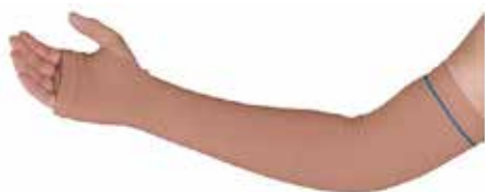
Arm Sleeve, Protective - X-Large Item No. 1899 $27 25