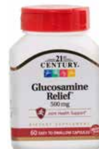
Glucosamine (Joint Health Support) † Item No. 1114