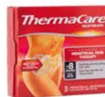
ThermaCare® Menstrual Relief Item No. 1913