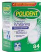
Polident® Overnight Item No. 1892