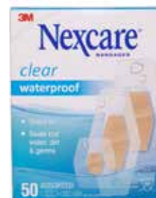
Bandages, Nexcare® Clear Waterproof, Assorted Sizes Item No. 1667