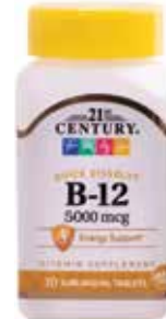
Vitamin B-12, Sublingual † Item No. 1974 $10 00 - 30 ct/5,000 mcg