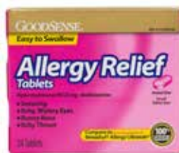
Diphenhydramine Antihistamine (Allergy Tablets) Item No. 1009