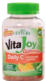
Vitamin C, Gummy † Item No. 1916 $11 00 - Compare to Vitafusion® - 60 ct/125 mg