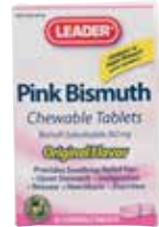
Pink Bismuth Chewable Tablets Item No. 1045