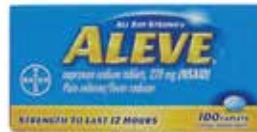
Aleve® Item No. 1104

- Compare to Tylenol Extra Strength® - 500 ct/500 mg