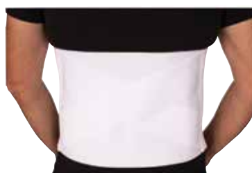
Back Support • Deluxe Criss Cross, Small - 28" to 32" Item No. 1760 • Deluxe Criss Cross, Medium - 33" to 37" Item No. 1759 • Deluxe Criss Cross, Large - 38" to 42" Item No. 1758 $24 00