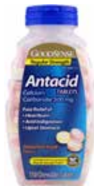
Antacid Chewables Item No. 1346