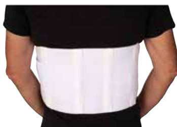
Back Support Elastic with Lumbar Item No. 1488 $28 00