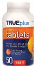
Glucose Tablets Item No. 1997