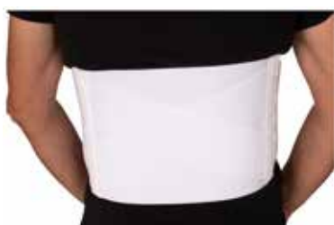
Back Support Elastic - 24" to 46" Item No. 1487 $25 00