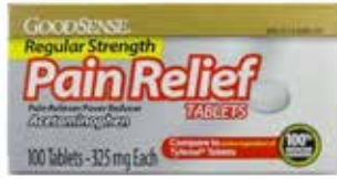
Acetaminophen (Pain Reliever, Regular Strength) Item No. 1001