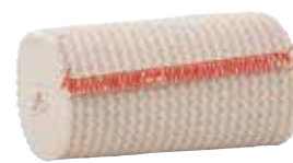
Bandage, Elastic - 3" x 5 yd Item No. 1209