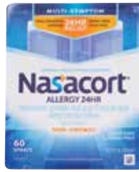
Nasacort® Item No. 1881