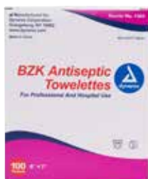
Antiseptic Towelettes Item No. 1201