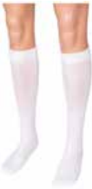
Compression Knee High Socks, Men's White †