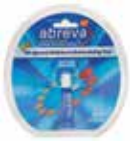
Abreva® Item No. 1152