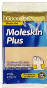
Moleskin Sheets Plus Item No. 1782