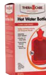
Warm or Cold Water Bottle, Rubber Latex Item No. 1781