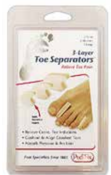
Toe Separator Item No. 1783