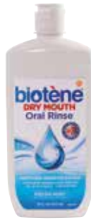
Dry Mouth Oral Rinse, Biotene® Item No. 1817