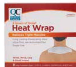
Heat Wrap - Neck, Shoulder, & Wrist Item No. 1860