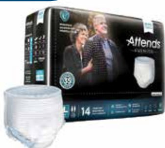
Premier® Disposable Underwear, X-Large - 56" to 68" Item No. 1992