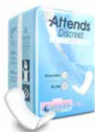
Attends® Discreet Women's Panty Liner Item No. 1815