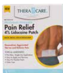
Lidocaine Patch Item No. 1871