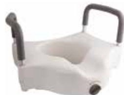
Toilet Seat, Raised, with Arms Item No. 1950