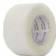
Tape, Transparent Surgical - 1" x 10 yd Item No. 1221