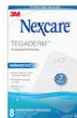
Tegaderm Transparent Dressing Item No. 1819