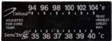
Thermometer, Fever Strip Item No. 1794 $8 00 - 1 ct