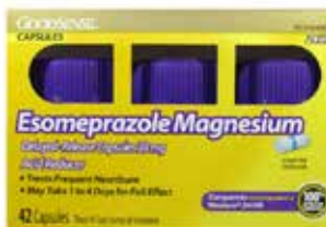
Esomeprazole Magnesium (Acid Reducer, Delayed Release) Item No. 1949