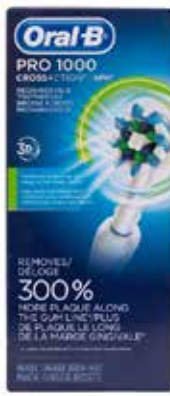
Toothbrush, Professional Care Electronic Item No. 1894