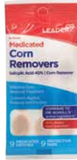
Corn Remover Pads Item No. 1236