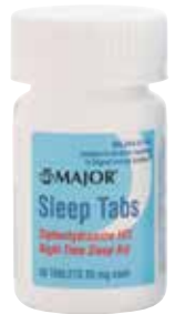
Sleep Tablets Item No. 1276