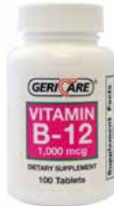
Vitamin B-12 † Item No. 1381 $8 00 - 100 ct/1,000 mcg