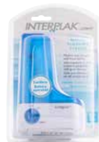
Water Jet Item No. 1744