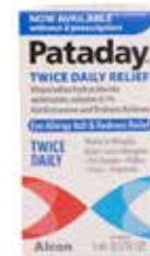
Pataday® Daily Release (Olopatidine) Item No. 1807