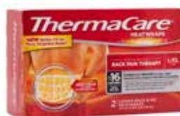
ThermaCare® Lower Back & Hip Item No. 1912