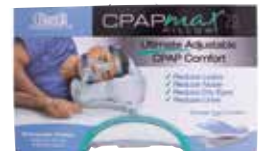
Pillow, CPAP, Memory Foam Item No. 1837