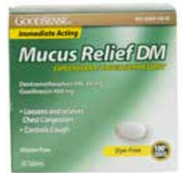
Mucus Relief DM Expectorant & Cough Suppressant (Guaifenesin/ Dextromethorphan HBr) Item No. 1178