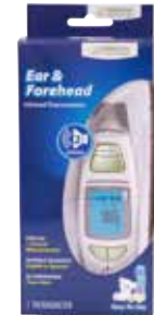
Thermometer, Talking Ear and Forehead Item No. 1925 $45 00 - 1 ct