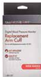
Blood Pressure Monitor, Desktop Replacement Cuff ‡ Item No. 1504