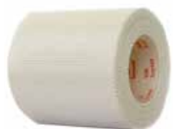
Tape, Silk Surgical - 2" x 10 yd Item No. 1220