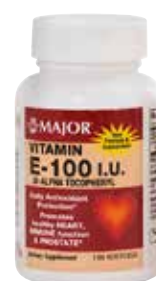
Vitamin E, Soft Gels ‡ Item No. 1391