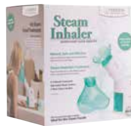
Inhaler, Personal Steam Item No. 1792