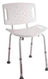
Bath Bench with Back