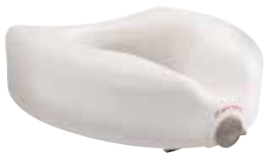
Toilet Seat, Raised Item No. 1729