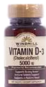
Vitamin D3, Natural ‡ Item No. 2078