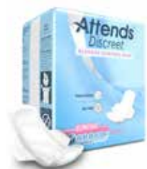
Attends® Discreet Women's Ultrathin Pad Item No. 1816