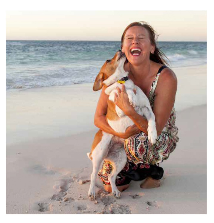
My Time Away

401(k) plan, Employee Stock Purchase Plan, Colleague Discount Program, Educational support and more.